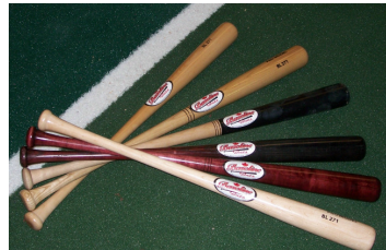
Customized Pro-Grade Baseline Bats that meet your individual specifications.

All models are available and custom models are welcome.